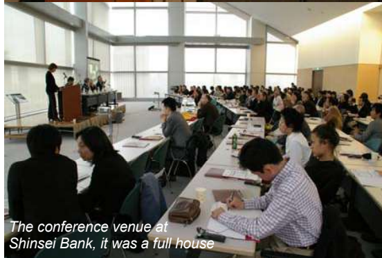
The conference venue at Shinsei Bank, it was a full house