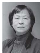
Ms. Itsuko Hasegawa