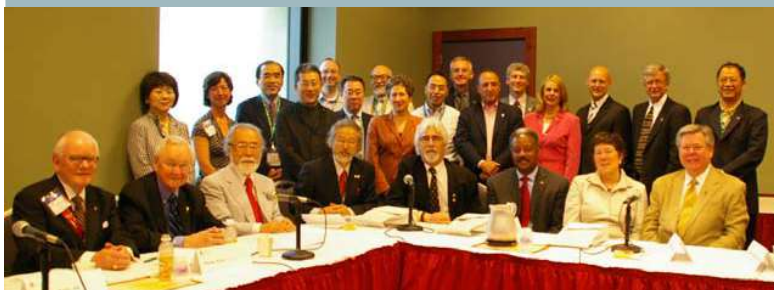
AIA & JIA Members meeting at the National Conference, San Antonio, TX