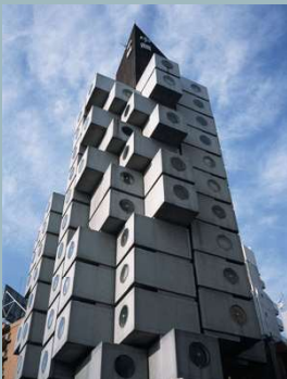
The Nakagin Capsule Tower, Ginza, 1972

Kurokawa was an honorary AIA member, friend and supporter of AIA - Japan. We express our sincere condolences to his family.