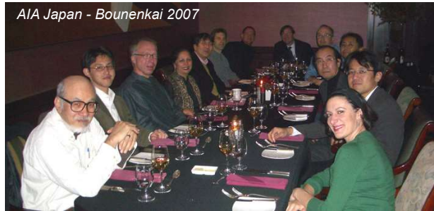
AIA Japan - Bounenkai 2007