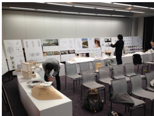
Presentation of student's works at Takenaka Corporation Headquarters Building.