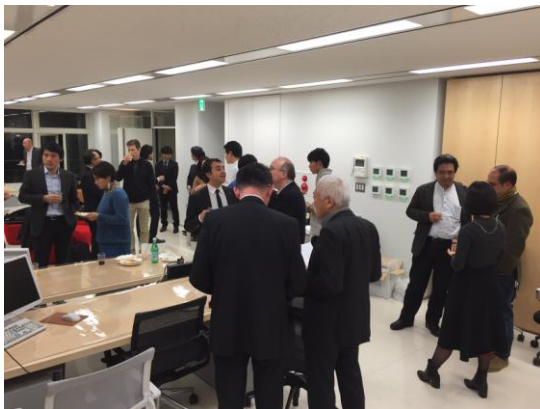
Members and guests networking and enjoying Elio's Restaurant's Italian food Showroom/Office of SHUKOH ONE.