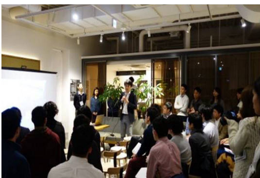
Student reception at UDS Harajuku office.