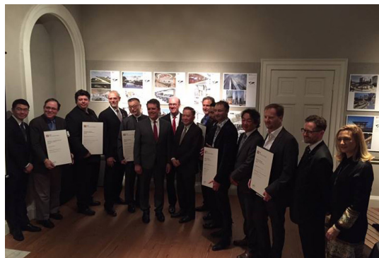
International Region Design Award Ceremony.