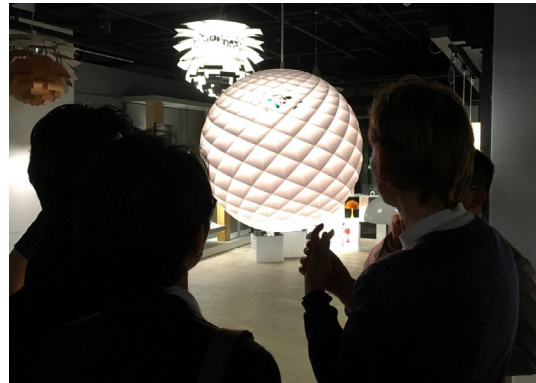
Øivind Slaatto at Louis Poulsen showroom.