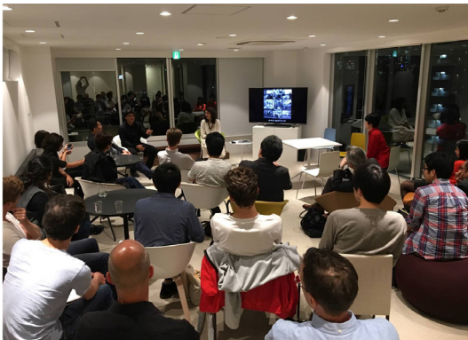
Opolis Architects, Mumbai at Arper showroom.

Overseas events included the Grassroots Conference in Washington, DC (February), the National Convention in Orlando (June), and the International Region Conference in Prague (October). At the IR conference, it was officially announced that Canada has been officially sanctioned as 7th Chapter of the IR (the other 6 are Japan, Hong Kong, Shanghai, Great Britain, Continental Europe, and Middle East). Future IR Chapters in our part of the world may include Singapore and Korea. The UIA Conference Seoul was held in September, with half a dozen AIA Japan members in attendance.