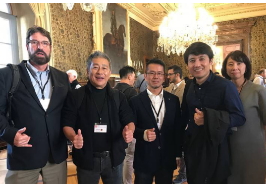
AIA Japan members at the IR Conference, Prague.